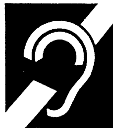
Figure 3. International symbol of access for hearing loss. From “Americans with Disabilities Act (ADA): Accessibility Guidelines for Buildings in Facilities” by United States Architectural & Transportation Barriers Compliance Board, 1991, Federal Register , 56, 144, July 26, 35512.

Title IV amends Title II of the Communications Act of 1934 by making available to all individuals an efficient communications service. The Federal Communication Commission ensures that inter- and intra-state telecommunica-